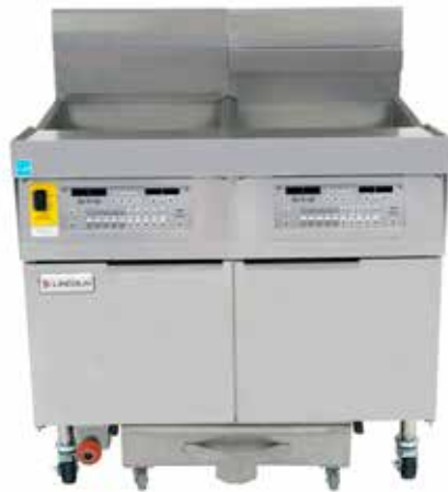
FPLHD265 with 3000 controller and front oil disposal.

Models specifically designed for ENERGY STAR® qualification, low flue temperature, and high-volume frying of bone-in chicken and other fresh breaded products