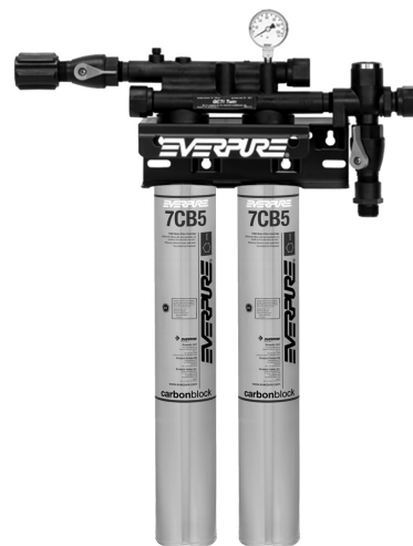
7CB5 Twin System with Check Valve Part # EV9797-40