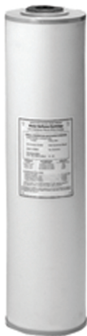
SO-10 Softening Cartridge: DEV9105-41