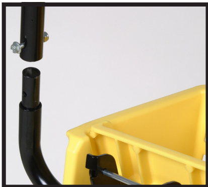
Wringer Handle Requires Assembly, Tools are Provided.