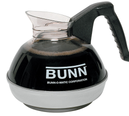
EASY POUR®,(BLK) 6/CS