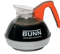
EASY POUR®,(ORN) 2/CS