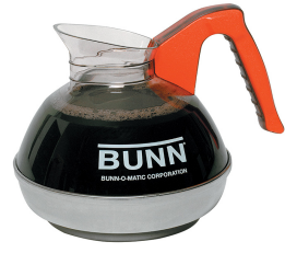
EASY POUR®,(ORN) 6/CS