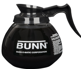
DECANTER, GLASS-BLK 12C 3/CS