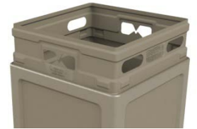
Patented Grab Bag™

Square waste container has a sleek and contemporary style with a snap lid closure and patented Grab Bag™ system to secure trash bag in place for a cleaner appearance. These heavy-duty waste containers are designed to withstand the harshest environments! Receptacle is perfect for indoor or outdoor use.