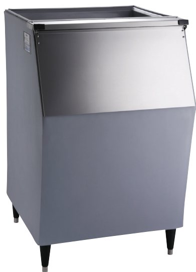
B530AP & B530SS