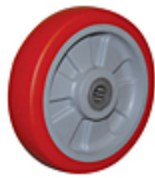
PP10 Moldon Polyurethane on Polypropylene Hub Wheel