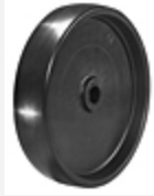
BT-W Solid Polyolefin Wheel