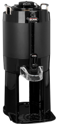
TF SERVER, 1.5G/5.7L MECH BLK