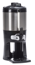
TF SERVER, 1.5G DSG GEN3