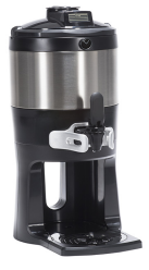
TF SERVER, 1G DSG GEN3