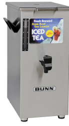
TD4T, W/ LIFT HANDLE