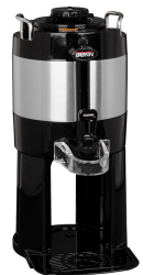
TF SERVER, 1G/3.8L MECH