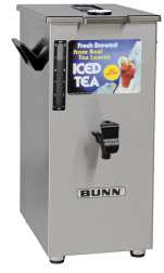
TD4T, W/BREW THRU LID & LIFT HANDLE