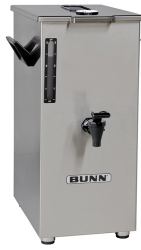
TD4T, BREW THRU LID NO DECAL NUDGER HDL