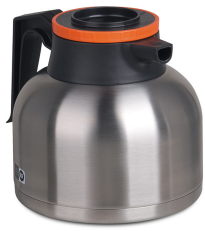
CARAFE, SST 1.9L SHRT ORN 1/