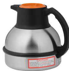
THERMAL CARAFE, ORN 1.9L 1PK