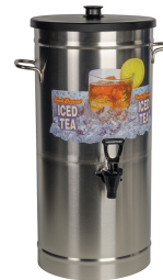
TDS-3.5, 3.5 GAL