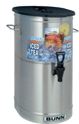
TDO-4, RESERVOIR BREW THRU