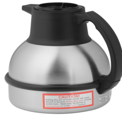
THERMAL CARAFE, ORN 1.9L 12PK