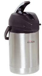
AIRPOT, 2.5L SST LA SINGLE PK