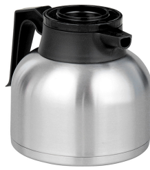
CARAFE, SST 1.9L SHRT BLK 12/