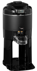
TF SERVER, DSG2 1G/3.8L BLK