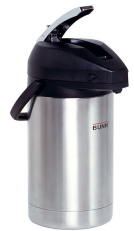
AIRPOT, 3.0L SST LA SINGLE PK