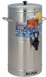
TDS-3, 3 GAL