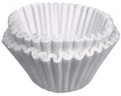
FILTERS TEA/SYS2 500PK/1 50/CL