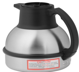
THERMAL CARAFE, BLK 1.9L 1PK