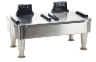
2SH STAND, 120V INF SERIES W/COMM