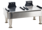
2SH STAND, 120V INF SERIES