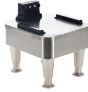
1SH STAND, 120V INF SERIES W/COMM