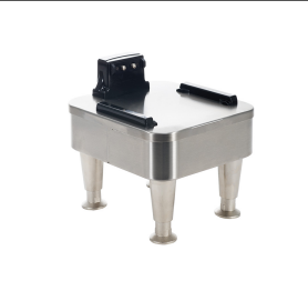
1SH STAND, 120V INF SERIES