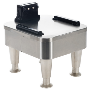
1SH STAND, 120V INF SERIES