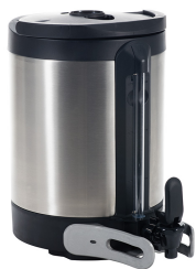
SH SERVER, 1.5/5.7L INF SERIES