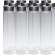
BOTTLES, GLASS WATER 12PK