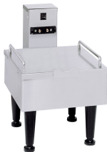
1SH STAND, 120V Product #: 27825.0000