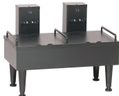
2SH STAND, 120V BLK Product #: 27875.0003