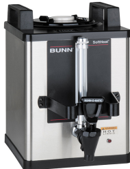
SH-S SERVER 1G 60 MIN ADJ TMR