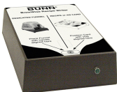
BREWWISE RECIPE WRITER Product #: 34444.0000