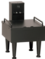
1SH STAND,120V BLK Product #: 27825.0003