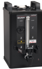
SH SERVER, 1.5G BLK 60 MIN ADJ TMR