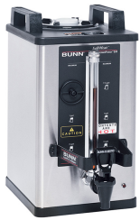
SH SERVER, 1.5G/5.7L 240 MIN ADJ TMR