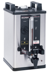
SH SERVER, 1.5G 120 MIN ADJ TMR AUTO OFF