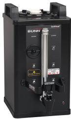
SH SERVER, 1.5G/5.7L BLK 120 MIN ADJ TM