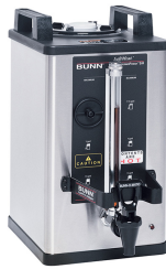
SH SERVER, 1.5G/5.7L 45 MIN ADJ TMR