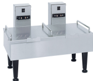
2SH STAND, 120V Product #: 27875.0000