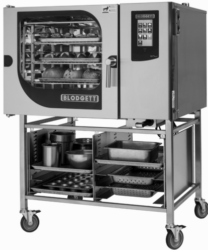
Shown on optional stand with casters