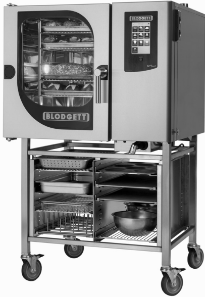
Shown on optional stand with casters

Single Electric Boilerless Combination-Oven/Steamer with Touchscreen Control