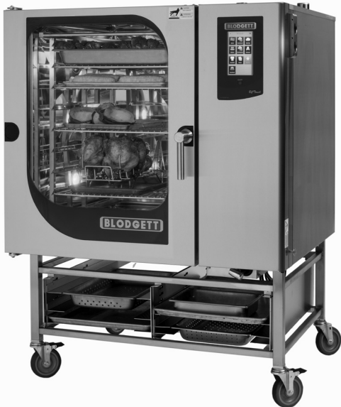
Shown on optional stand with casters

Boilerless Combination-Oven/Steamer with Touchscreen Control