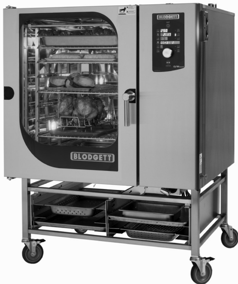
Shown on optional stand with casters

Refer to operator manual specification chart for listed model names.