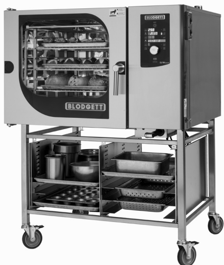
Shown on optional stand with casters