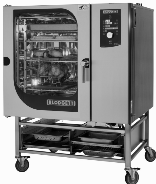
Shown on optional stand with casters