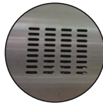
Vented Side Panels

All TIG welded using the TIG process. Welded seams finished to match adjacent surfaces. Unit polished to a satin finish.