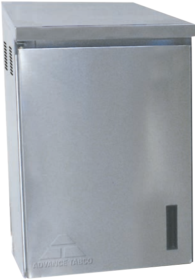
WCH-15-24 Left Hinged Shown (Standard)*