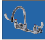
"-F" Series Sink Includes K-161-LU Gooseneck Faucets with Wrist Handles