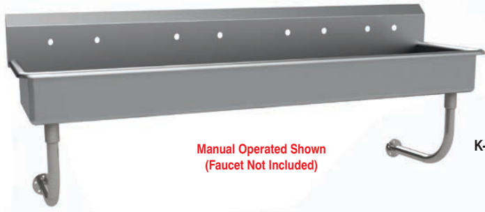
Manual Operated Shown (Faucet Not Included)