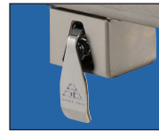
Knee Valves Included On All "KV" Models