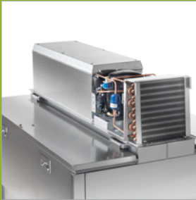
Easy To Service Top-Mount Modular System