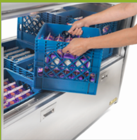
Sliding Door Protects Gaskets