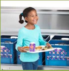
Lowest Loading Height