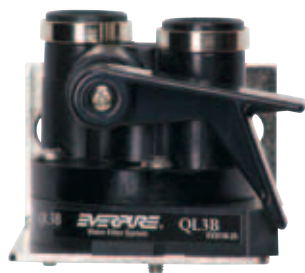
Everpure's replaceable filter cartridge (B-WFC, left) and the docking station (B-WFDS, above)