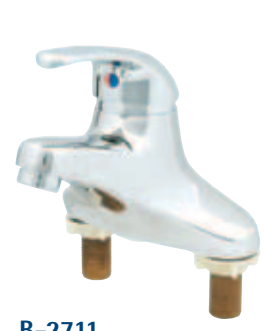
B-2711 Single Lever Faucet