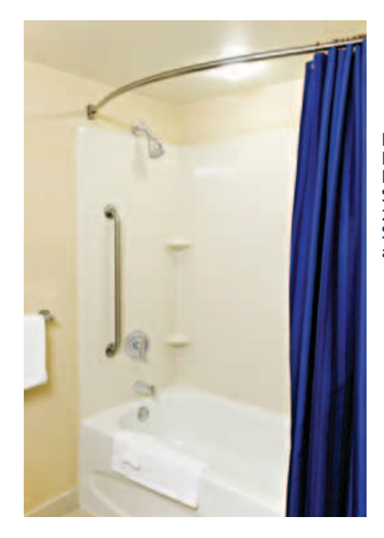
B-3200/B-3300 Pressure Balancing Shower Valve, 2.5 GPM Shower Head and Tub Spout