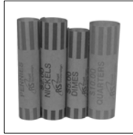
Coin Wrapper Starter Pack