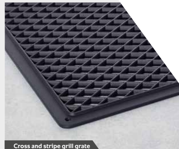
Cross and stripe grill grate