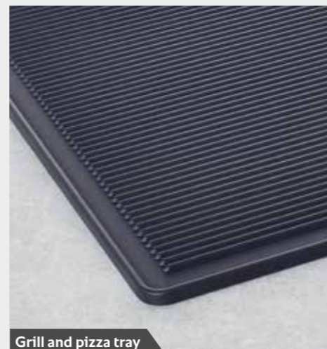
Grill and pizza tray