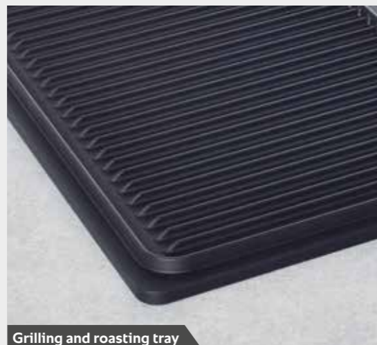
Grilling and roasting tray