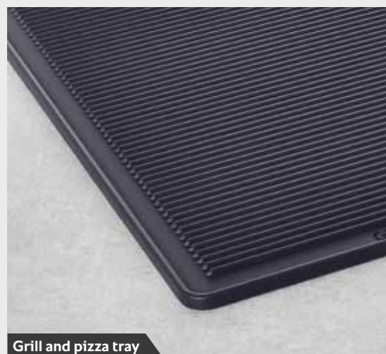
Grill and pizza tray