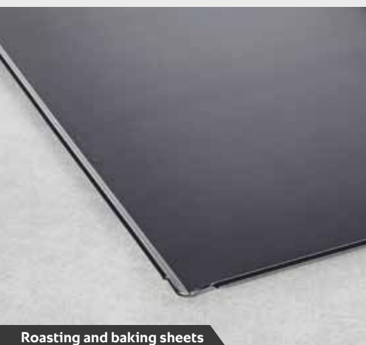
Roasting and baking sheets

You will find an overview of all our accessories in our accessories brochure and at www.rational-online.com .