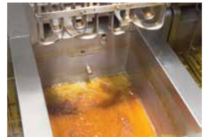
Built-in filtration rear flush moves crumbs to drain valve