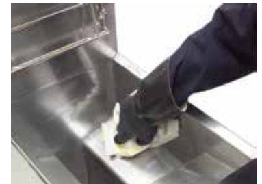
Good oil station management extends oil life