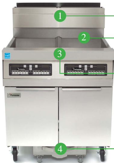
HD260 fryer shown with optional CM3.5 * controller and built-in filtration.

“Tube Fryers Good Enough to be Frymaster”