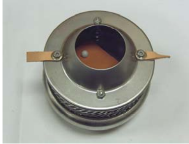
Figure 2 Side view

Shape leather floater by twisting as shown in view below. If floater will not retain its 'twist', dampen with water and allow it to dry.