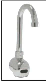
Splash Mount K-175 (Shown)