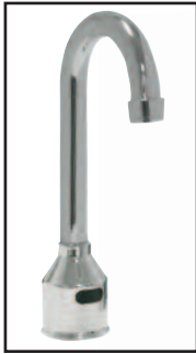
Deck Mount K-180