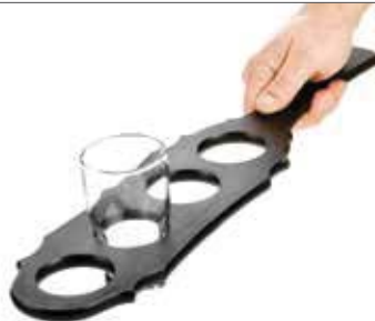
CUSTOM SHAPE & LASER ENGRAVING