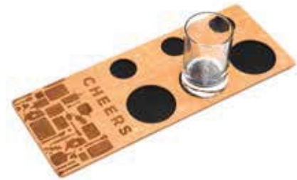
CUSTOM SHAPE & LASER ENGRAVING