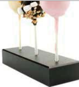
CUSTOM CAKE POP STAND