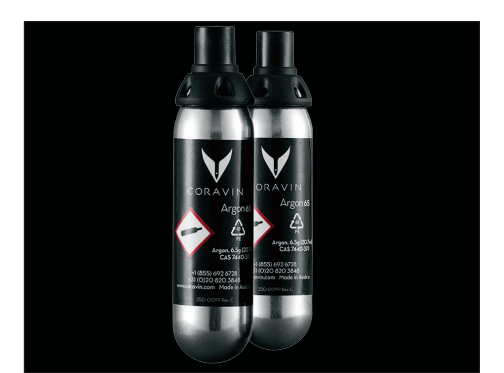
There is simply no substitute Manufactured in Austria, Coravin Capsules are produced with the most exacting deep-cleaning techniques, far exceeding food-grade standards.