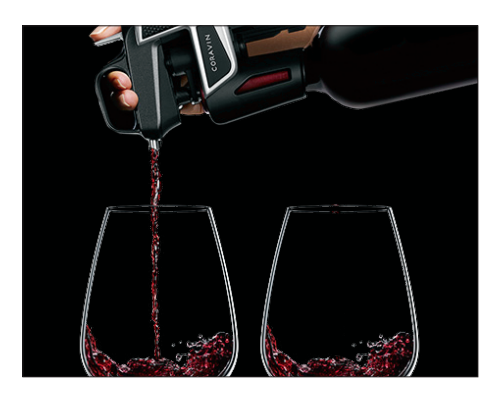
Multi-glass capacity Each capsule goes a long way, pouring up to 15 five-ounce glasses of wine.