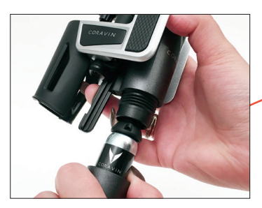
Patented Cap & Seal Technology Proprietary cap technology ensures no argon gas will escape the system – even months after initial use.