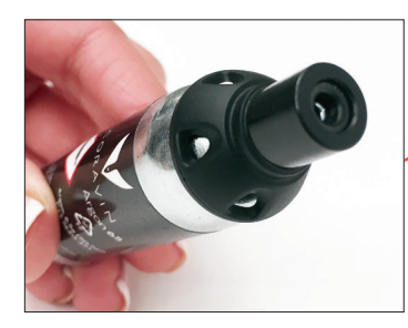
The Key to the Perfect Pour Only Coravin Capsules work exclusively with the Coravin System to deliver the perfect pour without leakage.