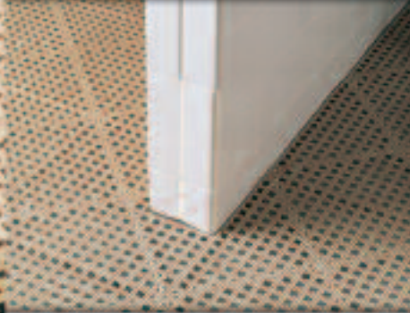
May be cut to fit any area.