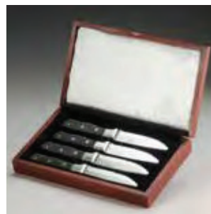
Wooden Display Box No. WB-100 H2 W7 L11¾ Holds 4 each of 201-2694