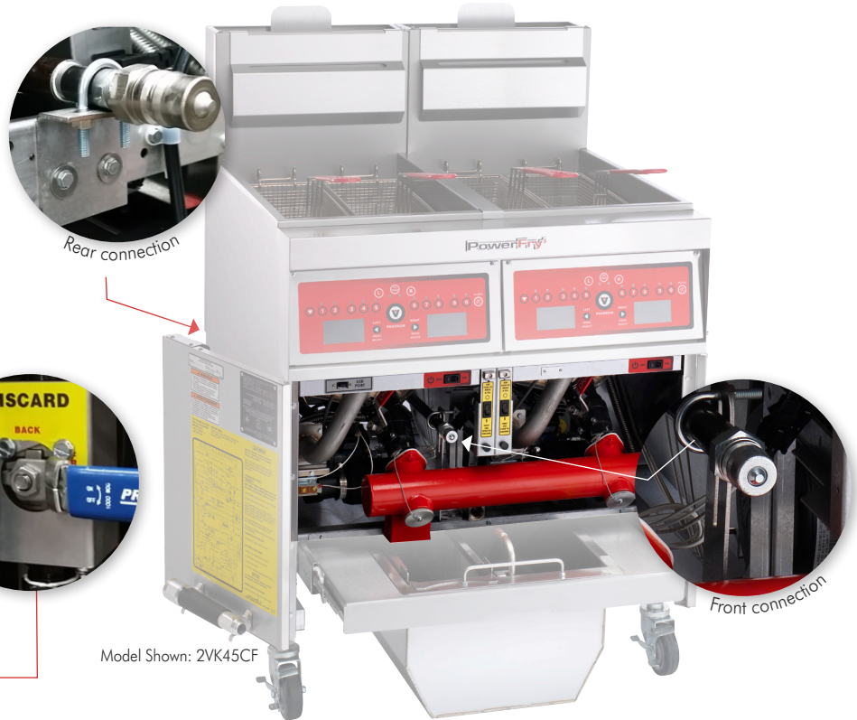
Model Shown: 2VK45CF

allows for rear oil discarding. This locking mechanism directs the flow of oil to the rear of the fryer to the "used" holding tank.