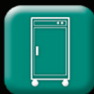
Holding & Transport