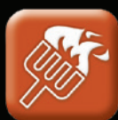
Griddles & Charbroilers