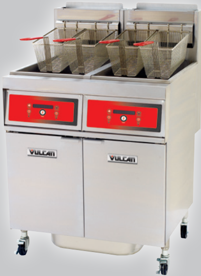
2TR45DF with KleenScreen PLUS® filtration system