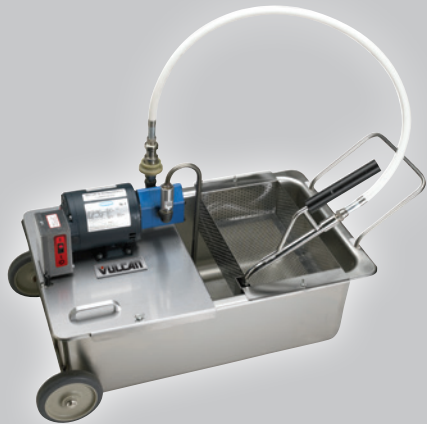
MF Mobile Filter