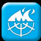
Heavy Duty Cooking