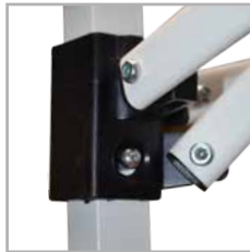
SOFT PRESS SLIDER BRACKET