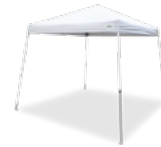
TOP & FRAME