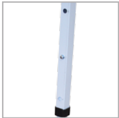
3 HEIGHT SETTINGS