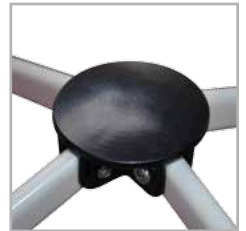
CATHEDRAL FRAME for extra headroom