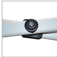
RIVETED JOINTS parts are replaceable