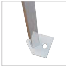
LARGER STEEL FOOTPAD