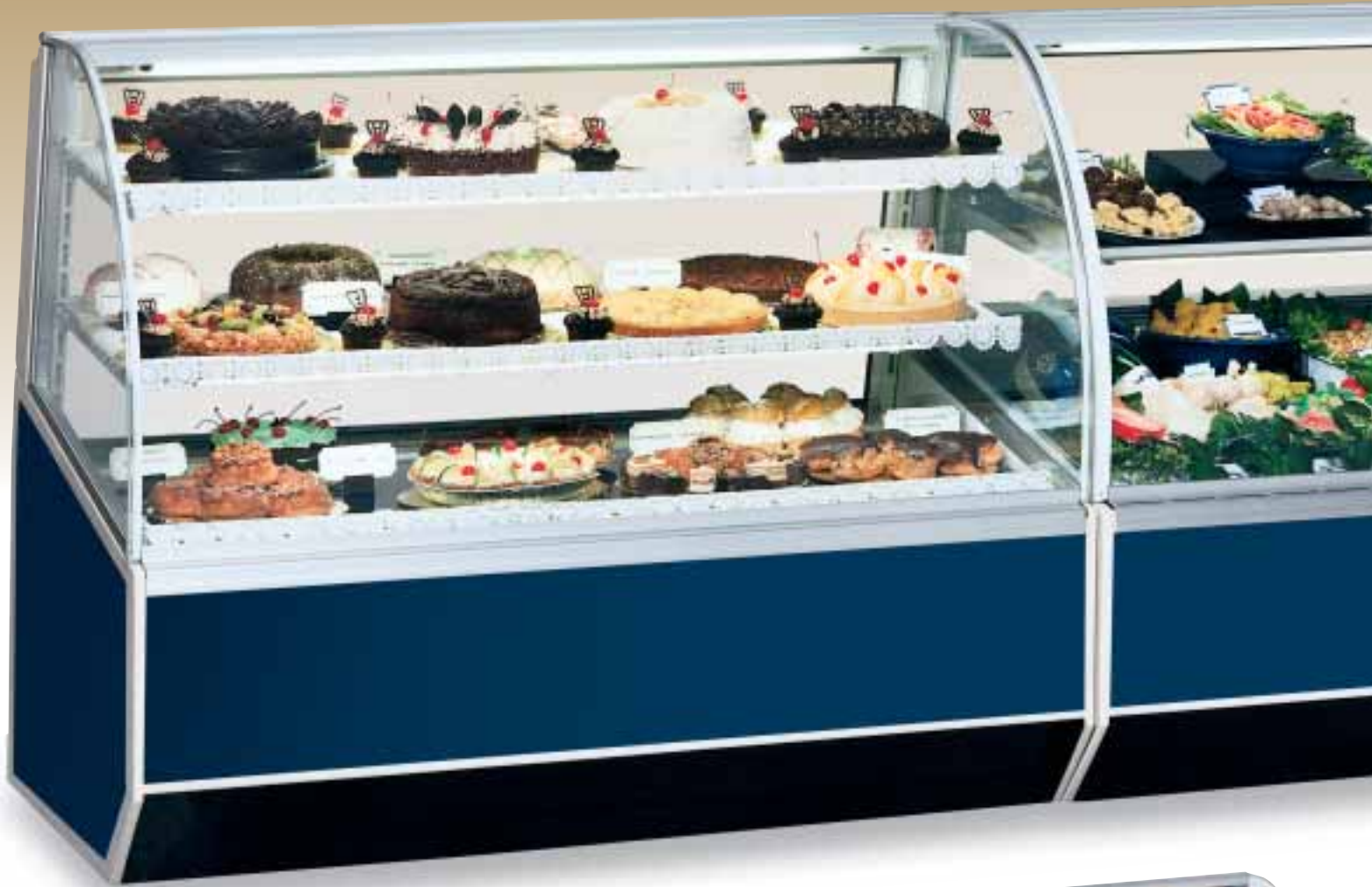
Series '90 Non-Refrigerated and Refrigerated Bakery System for maximum visual appeal