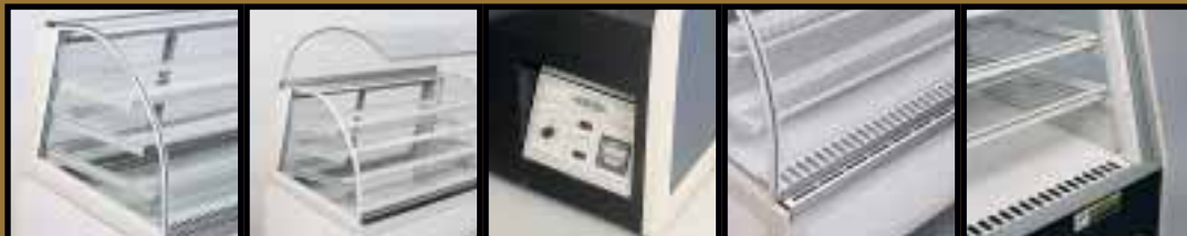
Adjustable cantilevered metal shelves