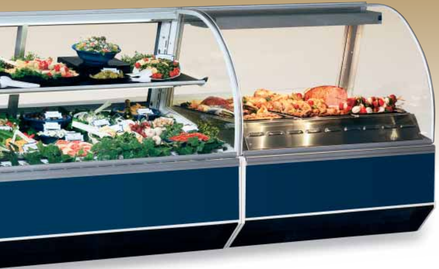
■ Refrigerated Self-Serve Display for impulse sales