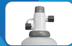
BH3-NPT Head 6240807

The Clear Choice for Commercial Applications