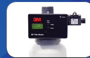
BH3WM-NPT Head** 6240810