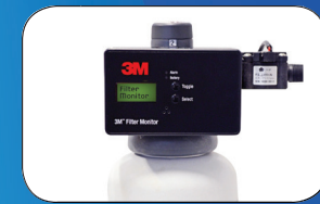
BH3M-NPT Head 6240809