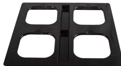
MODPAN INSERT MODMP161

1.25"H x 18.61"W x 16.88"D (32 x 473 x 429 mm)