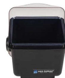
MINI DOME BD2002 (INCLUDES SHALLOW TRAY)