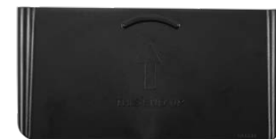
INTERCHANGEABLE TRAY DIVIDER