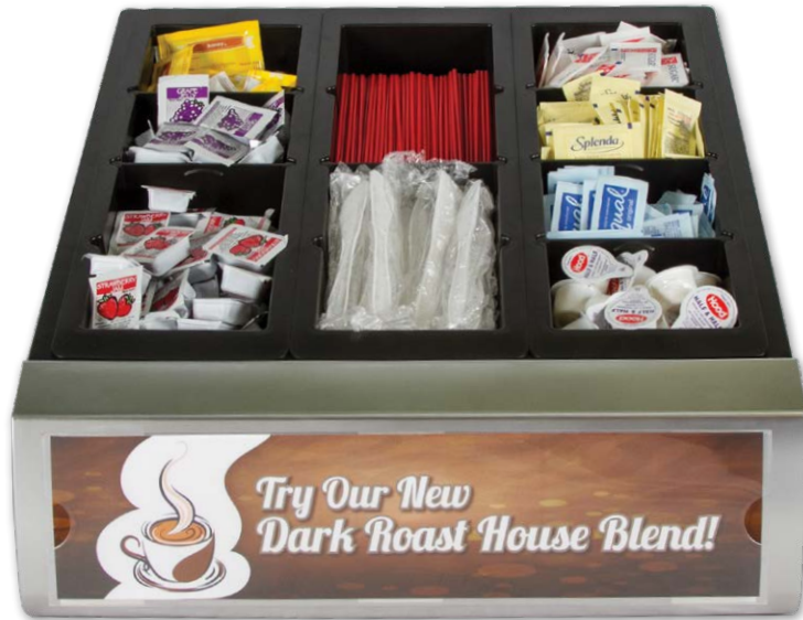
MODL2900KIT & MODGH100

The Modular Graphics Holder is a simple solution to displaying food items and alerting customers to in-house promotions. The holder attaches to the front of all Modular Counter Suite items. Fits graphics 4" x 17". (MODL900KIT, MODBD2002KIT, MODMP16KIT)