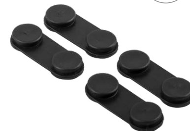
RUBBER LINKING FEET