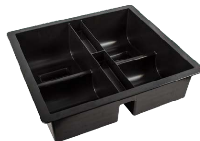
MINI DOME INSERT MODBD20021

6.05"H x 18.61"W x 16.88"D (154 x 473 x 429 mm)