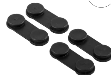
RUBBER LINKING FEET