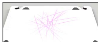
Visual Indicator is PINK on Blue, Green, White, and Yellow Boards