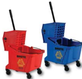
Color Coded Mopping Combo Pack