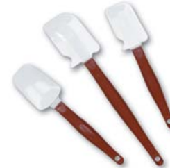
High Heat Scraper & Spatulas