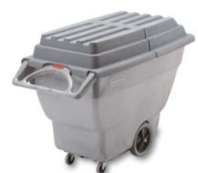
Structural Foam Tilt Truck & Lid