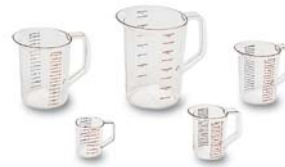
Bouncer® Measuring Cups