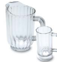
Bouncer® Pitchers & Mugs