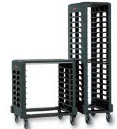
Max System™ Racks & Prep Cart