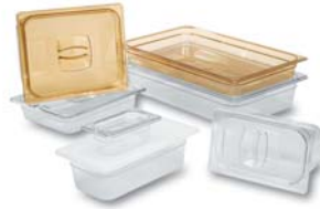
Cold & Hot Food Pans