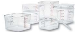
Square Space Saving Containers