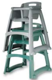
Sturdy Chair™ Youth Seats