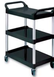
Utility Service Cart