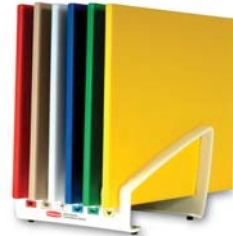
Color Coded Cutting Board System