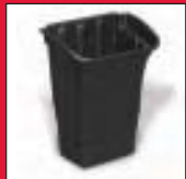
3353-88 Refuse Bin