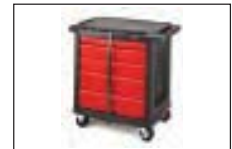
7734-88 5-Drawer Mobile Work Center 32 5 / 8 " x 19 5 / 16 " x 33 1 / 2 " (77.5 cm x 51.4 cm x 85.4 cm) 250 lbs (113.4 kgs)