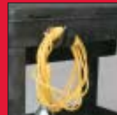
4591 Hook Kit (Set of 4)