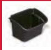
3354-88 Utility Bin