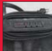
4590 3 Outlet, Surge Protected Power Strip