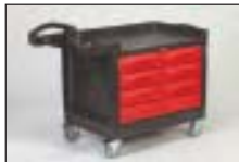
4534-88 8-Drawer Cart 48" x 26 3 / 8 " x 38 1 / 4 " (121.9 cm x 67 cm x 97.2 cm) 750 lbs (340.2 kgs)