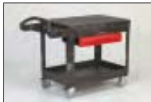
4535-88 Professional Contractor's Cart 52 1 / 8 " x 30 5 / 8 " x 37 1 / 8 " (133.4 cm x 77.8 cm x 96.2 cm) 500 lbs (226.8 kgs) — Includes Contractor Top