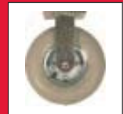
4592 8" Pneumatic Caster Kit Fits: 4532-88, 4533-88, 4534-88, 4535-88, 4548-88

Customer Service: 1-800-347-9800 www.rubbermaidcommercial.com