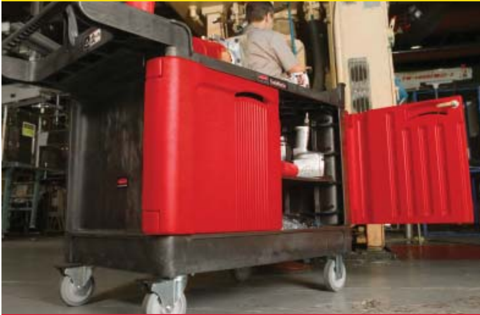
LARGE SECURE STORAGE