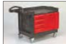
4548-88 4-Drawer and Cabinet Large 58 5 / 8 " x 26 3 / 8 " x 38 1 / 4 " (148.9 cm x 67 cm x 97.2 cm) 750 lbs (340.2 kgs)