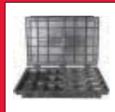
4536 Contractor Parts Organization Top Fits: 4532-88, 4533-88, 4534-88