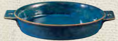
Tapas (Double Handled) F1468994300 (7½"), 23 oz., 2 Doz.