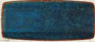
Sushi Plate (Narrow) F1468994760 (10½ X 4¾"), 2 Doz.