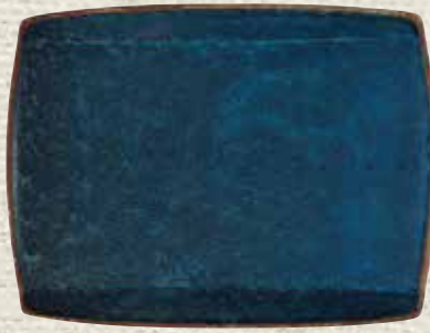
Plate (Rectangular) F1468994359S (11 x 8¾"), 2 Doz.