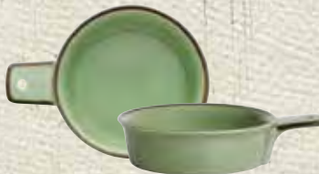
Tapas (Single Handle) F1463067108 (5"), 12 oz., 2 Doz.