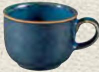
Cup (Espresso) F1468994525 (2⅝"), 3⅝ oz., 2 Doz.