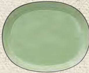
Platter (Oval) F1463067355 (10¼"), 1 Doz. F1463067363 (12"), 1 Doz.