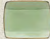
Sushi Plate (Square) F1463067115S (5½"), 3 Doz.