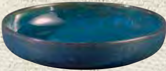
Tapas Dish F1468994283 (5"), 16 oz., 2 Doz. F1468994291 (7"), 23½ oz., 2 Doz.