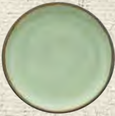
Plate F1463067115 (6"), 2 Doz. F1463067132 (8½"), 2 Doz. F1463067151 (10⅝"), 1 Doz.

Reminiscent of a fresh meadow, with its pale yellow/green glaze complimented by an earthy brown accent. The artists' two-toned application adds a dramatic flair to the many geometric shapes and serving vessels. Another reason to go green, food has a natural affinity to be plated on this color.