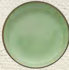
Plate (Deep) F1463067282 (10⅝"), 1 Doz.