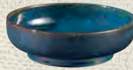
Footed Bowls / Ramekin F1468994285 (3¾"), 8 oz., 2 Doz. F1468994293 (4¾"), 9 oz., 2 Doz. F1468994301 (5½"), 14 oz., 2 Doz.