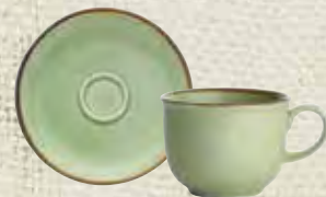
Cup (Espresso) F1463067525 (2⅝"), 3⅝ oz., 2 Doz. Saucer (Espresso) F1463067505 (4⅞"), 2 Doz.