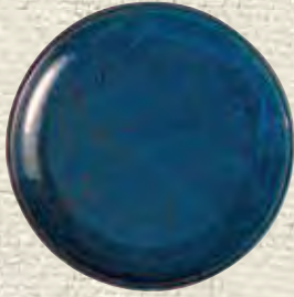
Plate (Deep) F1468994282 (10⅝"), 1 Doz.