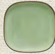
Plate (Square) F1463067001 (9⅞"), 1 Doz.