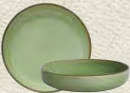
Tapas Dish F1463067283 (5"), 16 oz., 2 Doz. F1463067291 (7"), 23½ oz., 2 Doz.