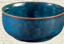
Bowl (Cereal) F1468994701 (5"), 15¼ oz., 2 Doz.