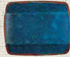
Sushi Plate (Square) F1468994115S (5½"), 3 Doz.