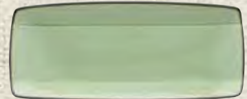
Sushi Plate (Narrow) F1463067760 (10½ X 4⅝"), 2 Doz.