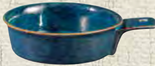
Tapas (Single Handle) F1468994108 (5"), 12 oz., 2 Doz.