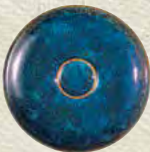
Saucer (Espresso) F1468994505 (4⅞"), 2 Doz.