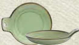
Cocktail Plate (Round) F1463067109 (4"), 4 Doz.