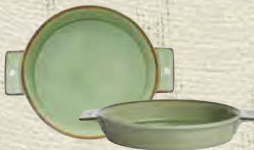
Tapas (Double Handled) F1463067300 (7½"), 23 oz., 2 Doz.