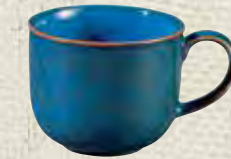
Mug F1468994042 (3¾"), 11¼ oz., 2 Doz.