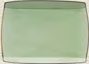
Plate (Rectangular) F1463067359S (11 x 8⅝"), 2 Doz.