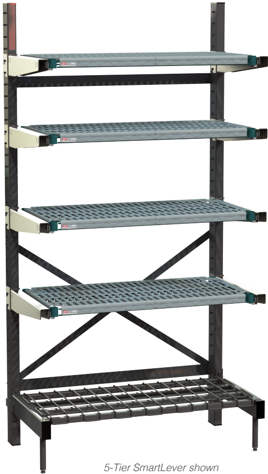
5-Tier SmartLever shown with Super Erecta Pro Shelves and Dunnage base.