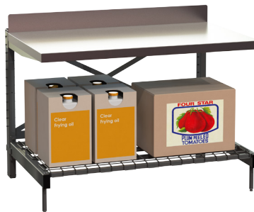
Make the most above dunnage storage by adding a worksurface.