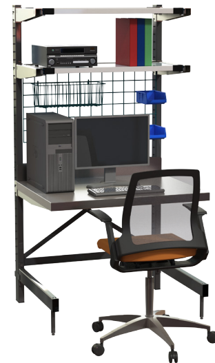
A usable space with all items within reach can be created for any job or task.