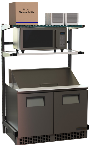
SmartLever shown as used for overhead storage accommodating other needed equipment.